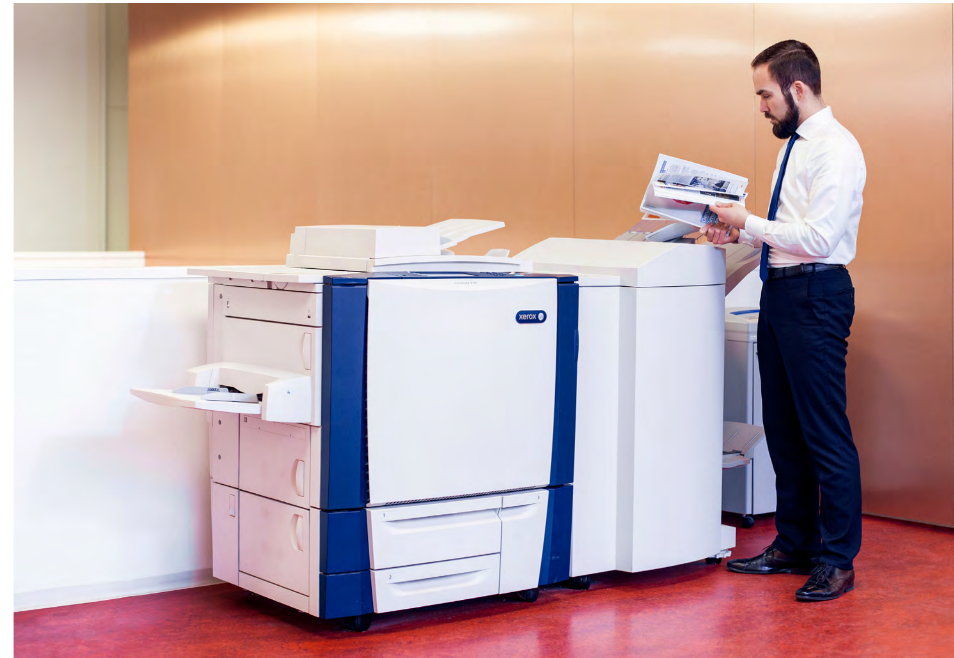
YSoft SafeQ scan workflows are fully integrated within all major multifunction device (MFD) brands.

Automated scan workflows enable organizations to digitize traditionally paper based tasks which improves productivity. Automated scan workflows offer many more additional benefits for the employee and the organization. However, for many organizations, improving productivity is the driving factor for automated scan workflow adoption.